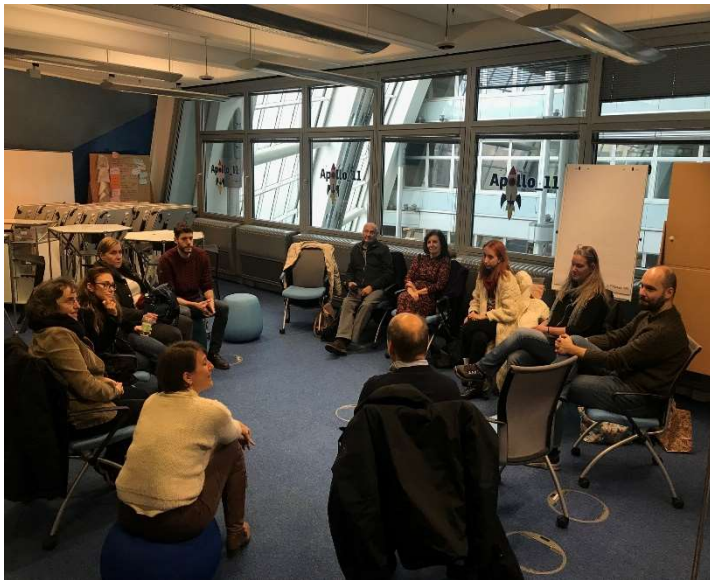
Image 2 Discussing in the Chamber of Commerce in Berlin

Based on the Best Practices Repository, the Meta-coin Consortium is now working on creating a structured working platform populated with training materials in meta-skills and internationalisation skills accessible at EQF-levels 3-6 providing an upskilling pathway. More specifically, the partners have completed the 2 nd working seminar and peer-learning activity taken place in Berlin in 28-30 th of November, where they worked on the structure and the methodology of the online course that will be available on the project’s website https://metacoinproject.eu/ .