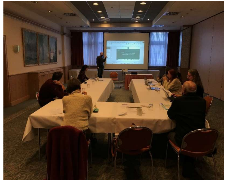
Image 3 The 3 rd Transnational Partners Meeting

The content of this publication represents the views of the author only and is its sole responsibility. The European Commission does not accept any responsibility for use that may be made of the information it contains.